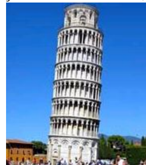
Leaning Tower of Pisa; Livorno

Call Ruth at F & L Tours for a detailed flyer ~ 941.575.9595